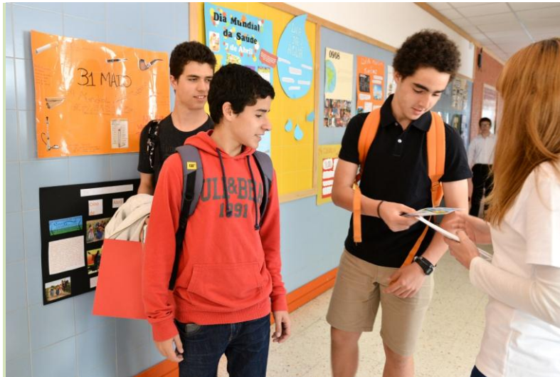
Figure 1: Engaging High School students with the gaming contest

More information on http://www.cside.pt/case_portugal.asp