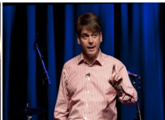
Recruitment approach from the EcoGrid project; organize local events