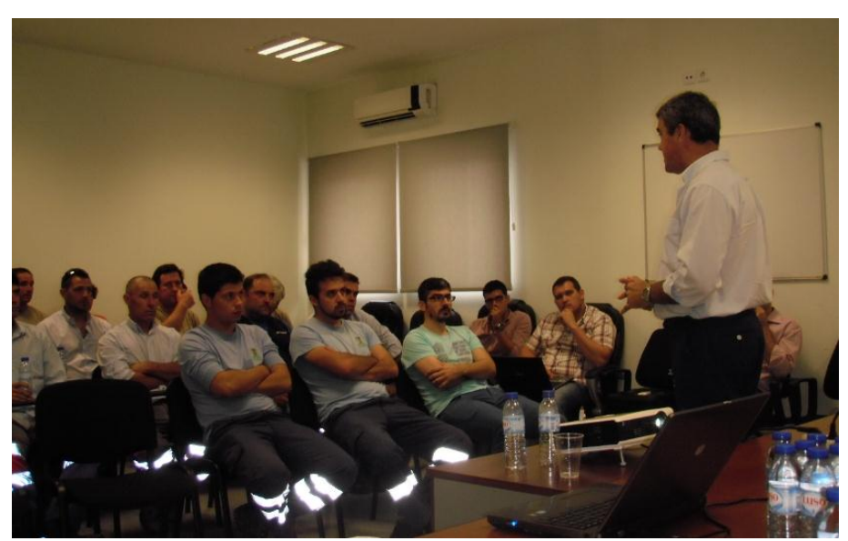
Figure 3: Installers training session in EDP's InovGrid project