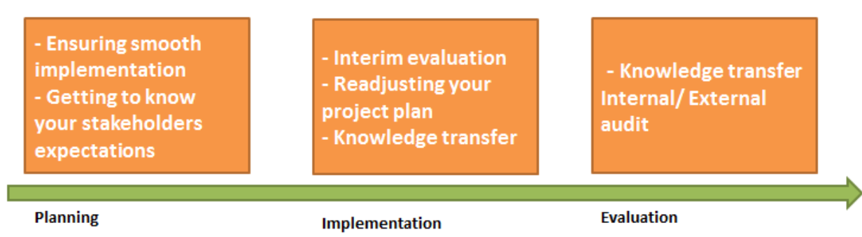
Figure 2: Benefits of an ENact 2020 Workshop in different stages of a project

The advantages of the ENact 2020 workshop for the different phases in a smart energy project: