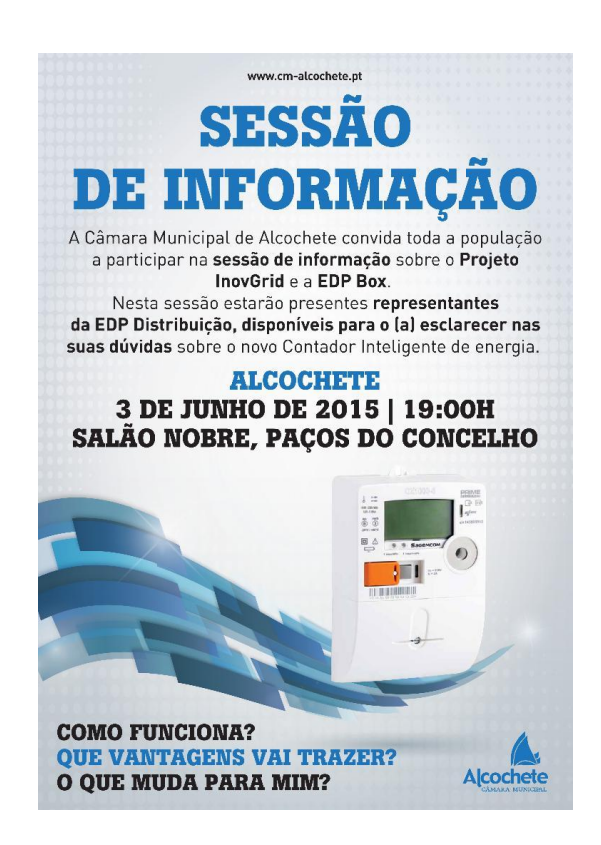
Figure 2: Poster of an informative session about the Inovgrid Project by EDP and the installation process that took place the city hall of Alcochete, Portugal